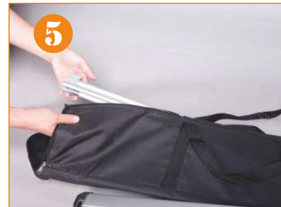
5. Take out the pole from the bag