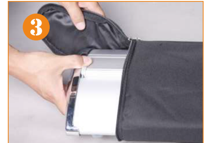
3. Take out the base from the bag