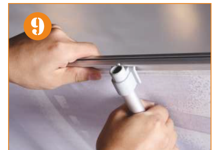
9. Fix the pole on the top bar