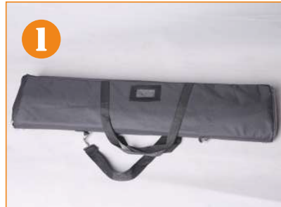
1. Bag with stands