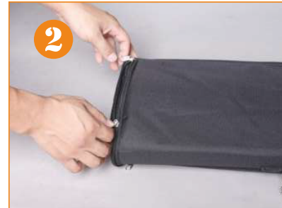
2. Open the bag like this