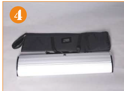
4. Put on the ground