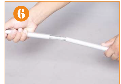
6. Fix the pole