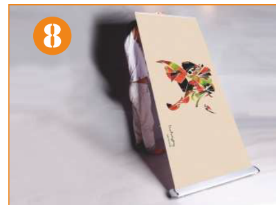
8. Tilt the unit toward yourself while raising the graphic to the top of the pole